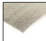
2mm or 3mm Silver